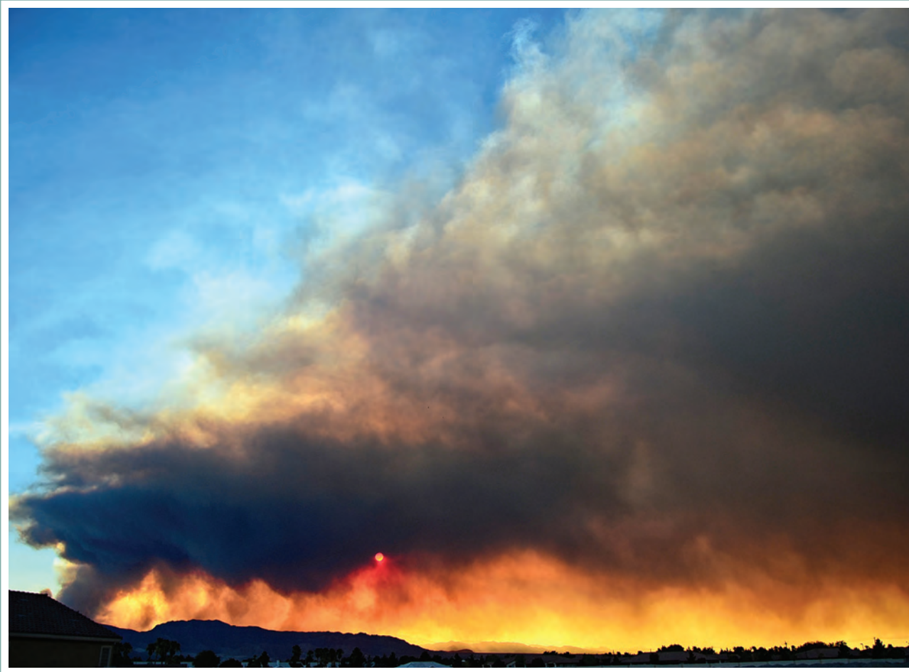
Smoke drifting over Las Vegas from Mount Charleston fire, 2013.