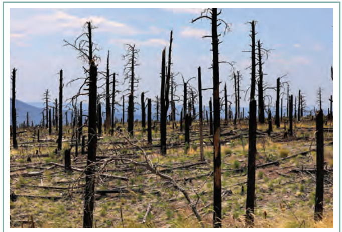
Aftermath of Schultz fire.