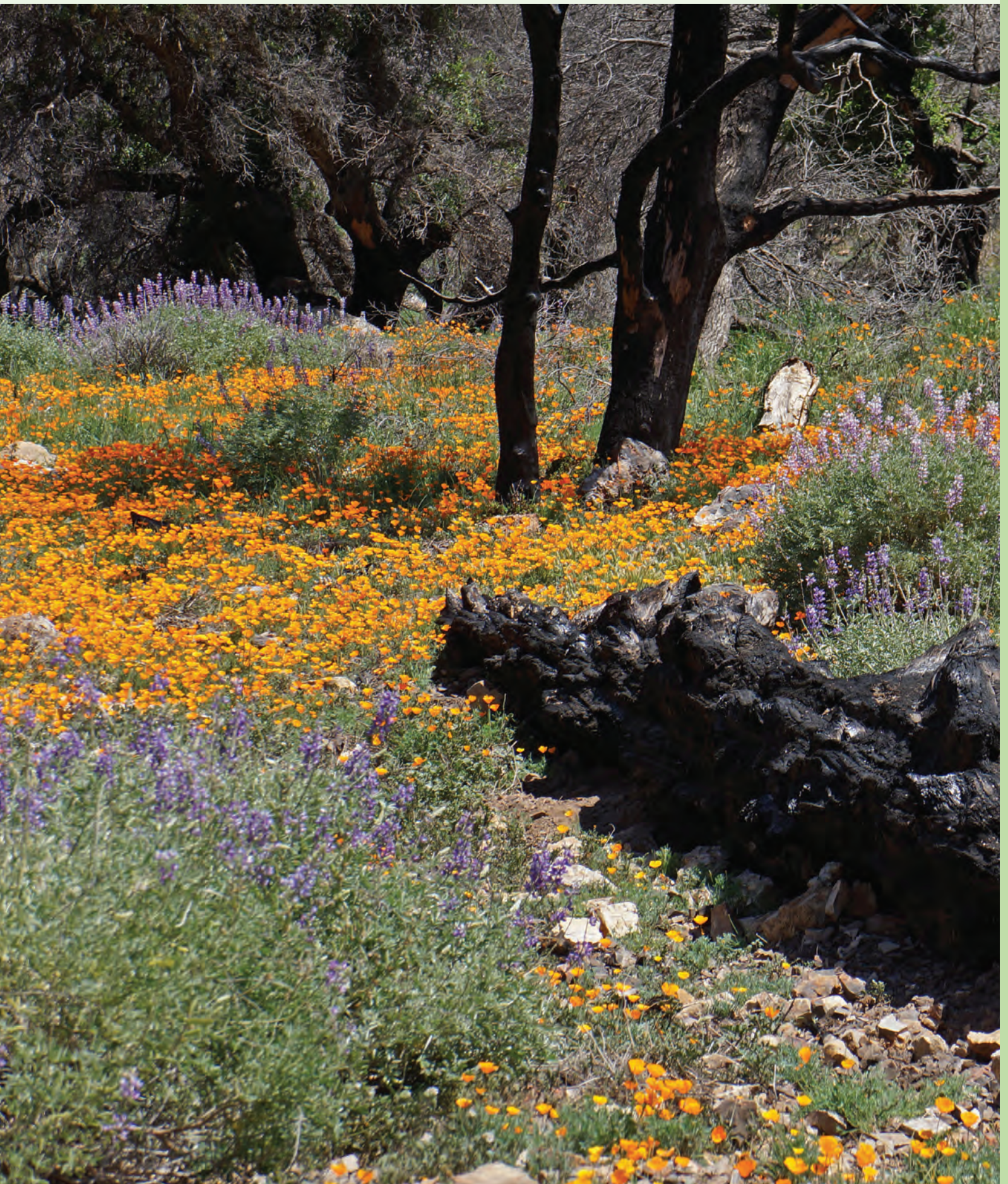
Post-fire wildflower display.