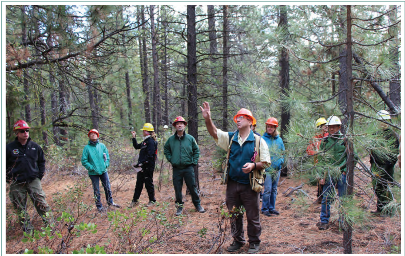
Collaborative forest restoration partnership in the Greater La Pine Basin, Oregon.

Reintroducing fire into systems through the use of prescribed or controlled burns is one of the most important restoration approaches, and there is a need to dramatically expand the appropriate application of this management tool. There are places, however, where fuel loads are simply too high or conditions too dangerous for prescribed burns to be safely used. In these instances hazardous fuel loads can be reduced through a variety of mechanical thinning techniques. Ecologically appropriate thinning usually emphasizes removal of small diameter trees and dense understory vegetation. Salvage logging, which focuses on post-fire harvesting of larger-diameter standing trees, is far more controversial. Although providing economic benefit, it should only be considered on a