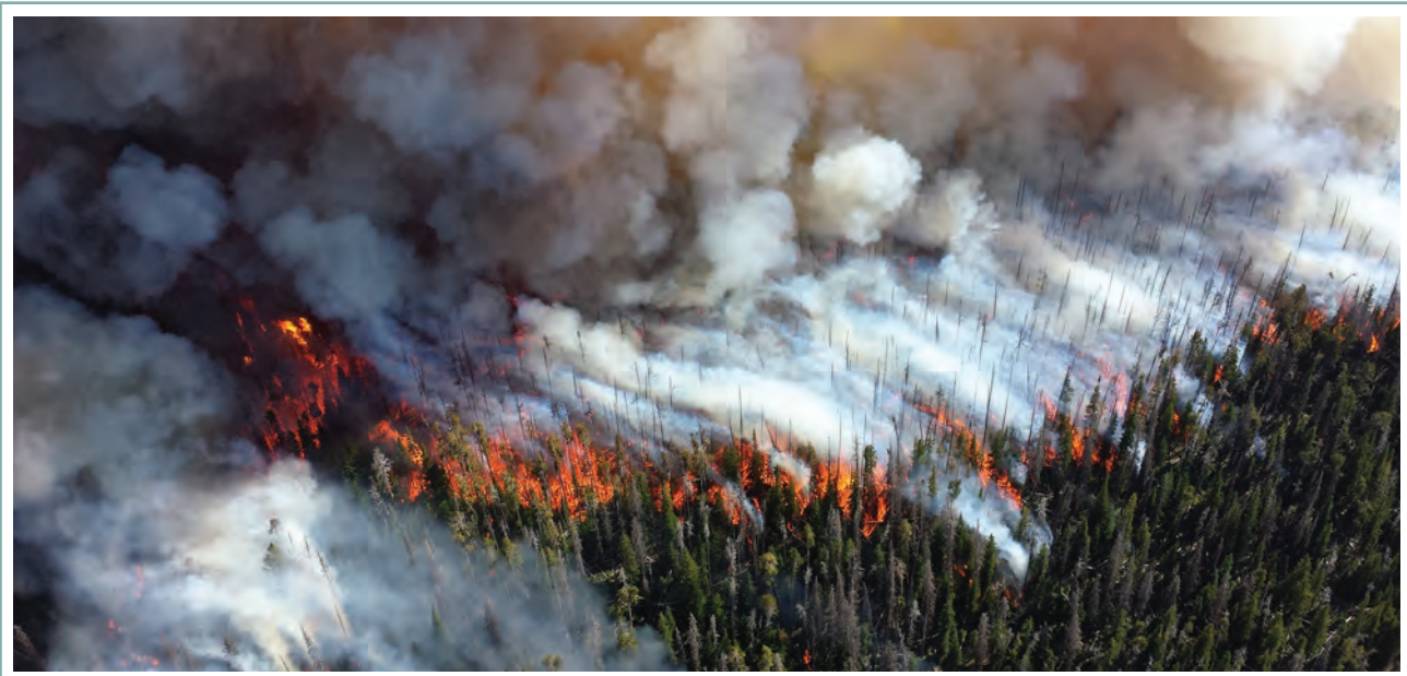
Druid fire, Yellowstone National Park, 2013.

W ildfire, like actors in a Greek drama, has two opposing faces: one of destruction and another of rejuvenation. Scenes of smoldering forests and burnt-out homes vividly illustrate the destructive force of uncontrolled wildfires. Paradoxically, many U.S. forests are not only adapted to burn periodically, but actually depend on fire for their rejuvenation, maintenance, and health. Consequently, forest and wildfire management is and always has been an extraordinarily complex and high stakes issue, which rapid climate change is making even more challenging. In particular, the increase in large, intensely hot “megafires” not only poses increased risks to local communities and economies, but has the ability to permanently transform the ecosystems and habitats through which they burn, with profound implications for wildlife.