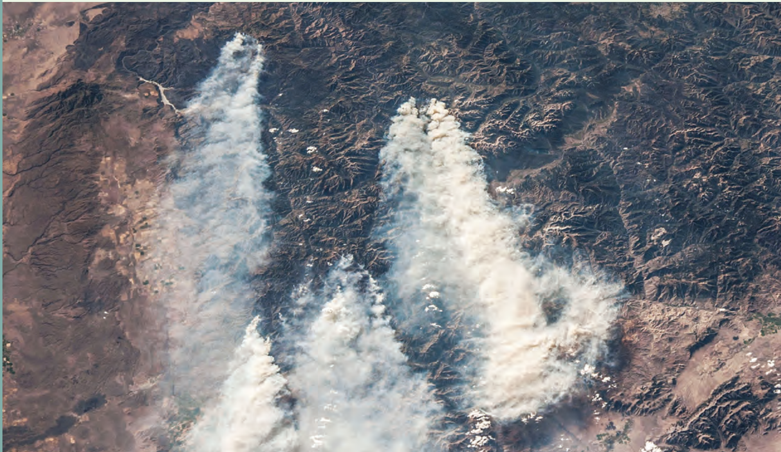
Wildfires in central Idaho, 2013.