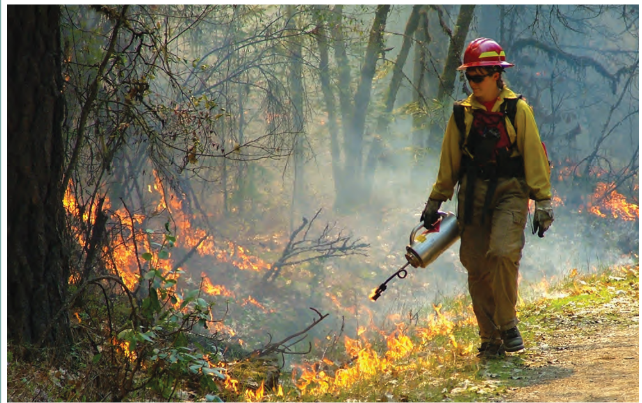
Prescribed burn, western Oregon.