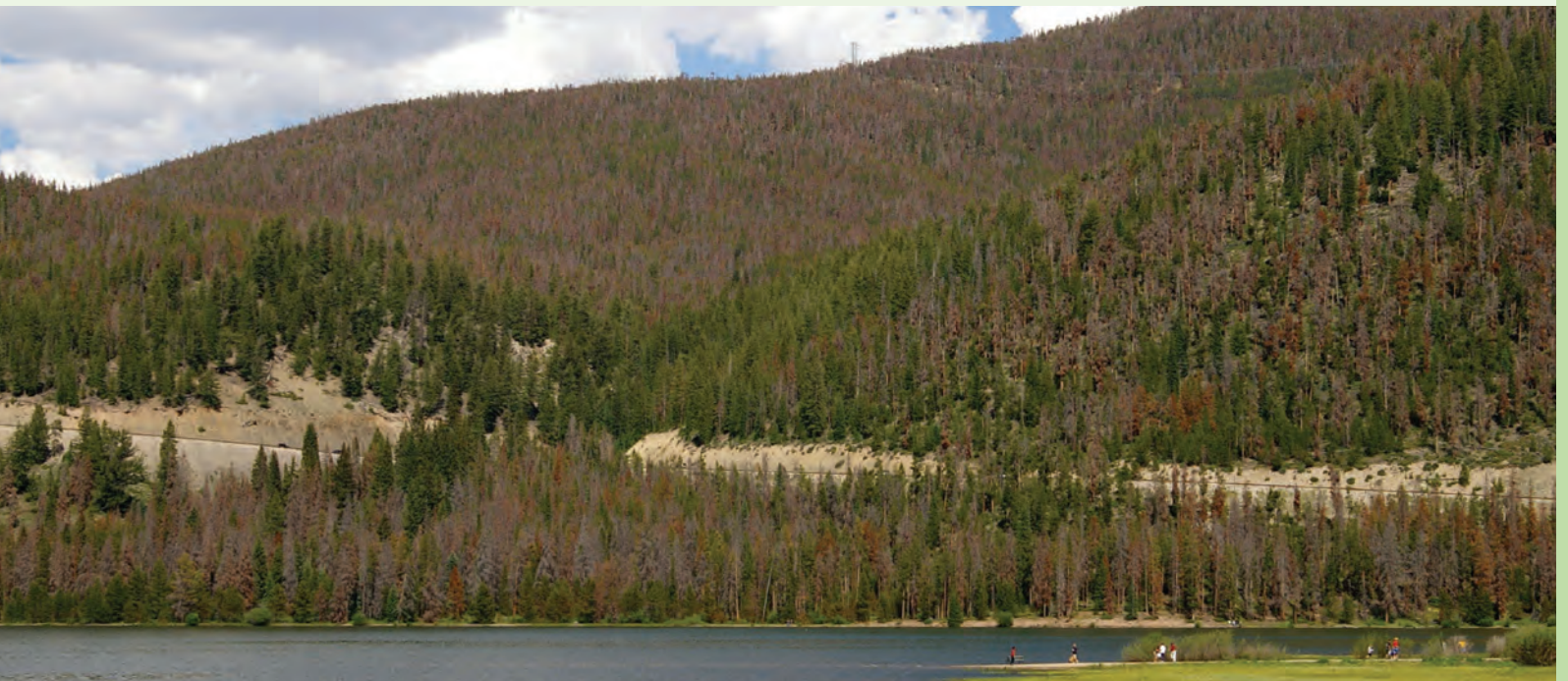
Mountain pine beetle infestation, Colorado.