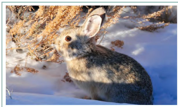
Pygmy rabbit.

Some wildlife may be able to adapt or even thrive in fire-altered or transformed habitats, or migrate to areas better supporting their needs. Others, though, will be negatively impacted either as an immediate effect of a large fire, or in the aftermath when food resources, water, or shelter are hard to come by, or their habitats are permanently lost. 21