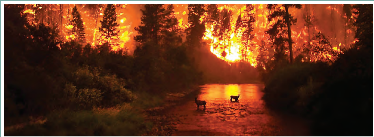
Elk taking refuge in river, Sula fire, Montana, 2000.