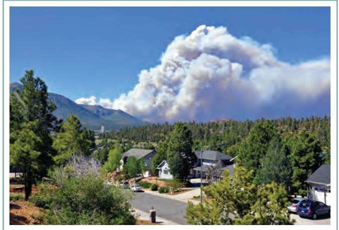
Schultz fire above Flagstaff, Arizona.

Monsoon rains following the fire caused heavy flooding that resulted in extensive property damage in Flagstaff and took the life of a young girl.