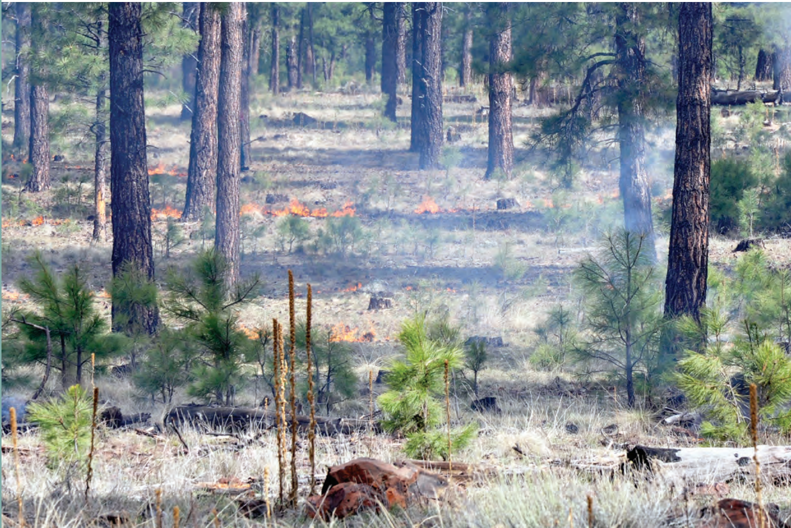
Low-intensity prescribed burn in ponderosa pine forest on the Coconino National Forest, Arizona.

that resulted in relatively open forest conditions. 46 In contrast, northern Rockies lodgepole pine forests historically had long fire return cycles (often greater than 100 years), with high-severity, stand-replacing crown fires (as occurred, for example, in the 1988 Yellowstone fires). Understanding natural fire regimes is key to evaluating forest restoration needs, since they provide a benchmark for determining the degree to which current forest conditions deviate from their