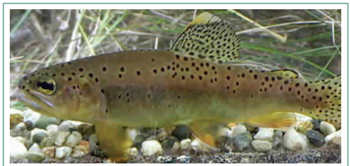
Apache trout.