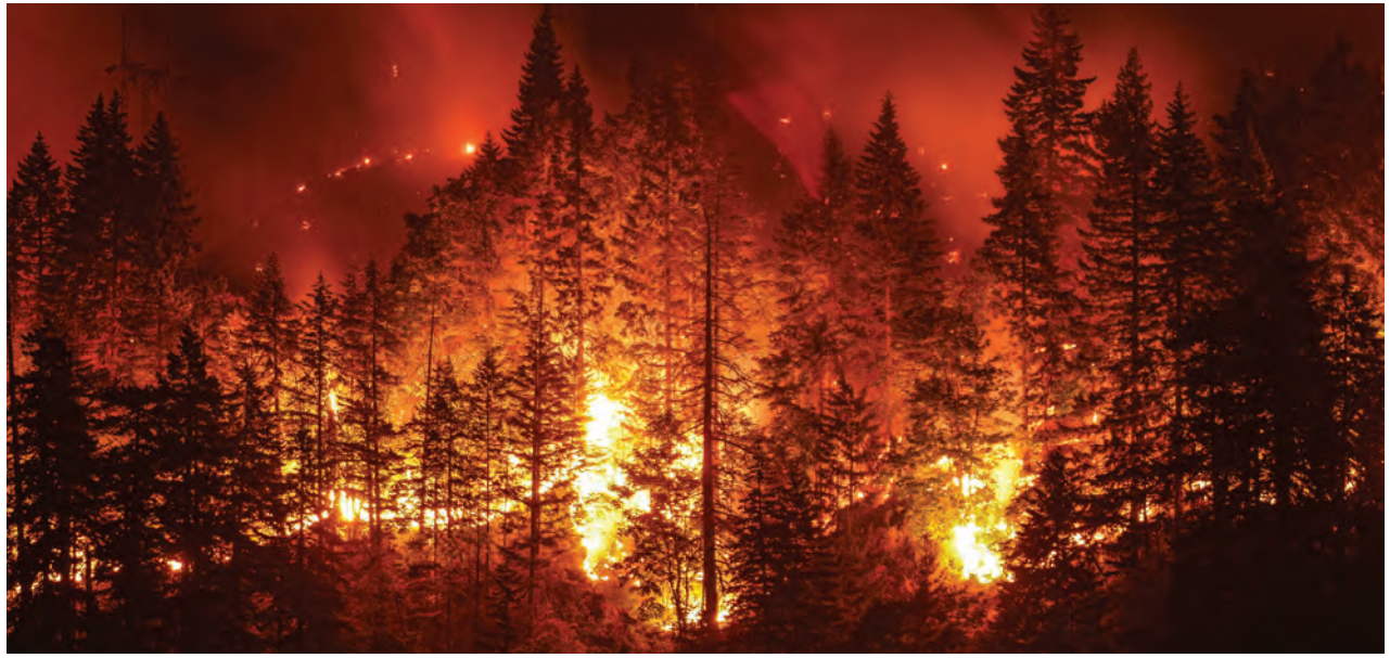
Eagle Creek fire along Columbia River Gorge, 2017.

F or several years California and other parts of the West have been in a severe and sustained drought, and the La Niña weather of last winter was anticipated to reduce the risk of severe wildfire in the region by bringing more rain and snow. Intense summer heatwaves, however, countered many of the expected benefits, and the explosive growth of annual grasses stimulated by winter rains may have even added to the fire risk. These conditions set the stage for the deadly wildfires now scorching nearly 200,000 acres across California and devastating many local communities. Indeed, 2017 is on track to be one of the most active years for U.S. wildfires on record, with a total of 8.5 million acres burned, and more than 21,000 firefighters assigned to wildfires in 10 western states. 3