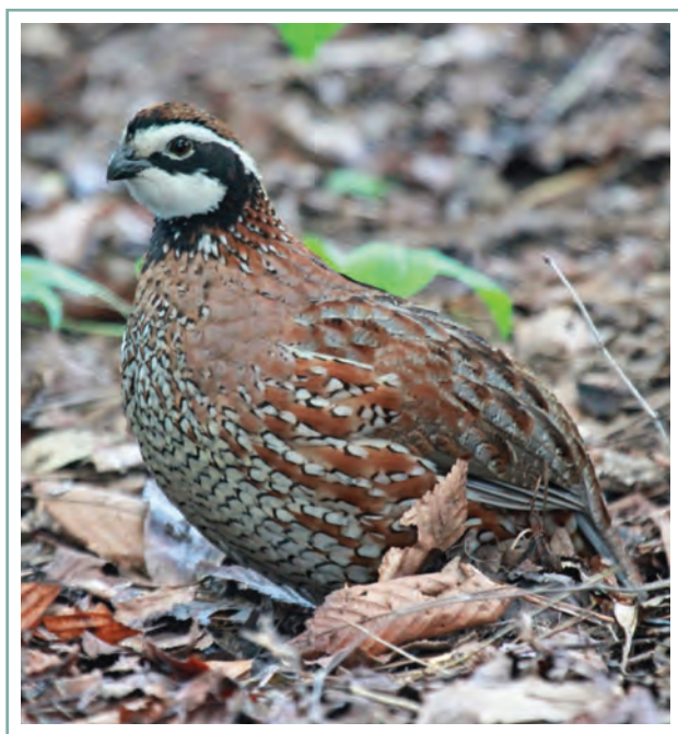
Northern bobwhite quail.

Prescribed burns are an important and widely used management tool in the region, and are essential for maintaining and restoring the biologically rich longleaf pine forests, as well as for rebuilding populations of popular game species like bobwhite quail. To be effective and safe, these controlled burns must be carried out under particular weather conditions. Projected climate shifts are likely to shrink the availability of those conditions and significantly constrain the capacity for wildlife and natural resource managers to employ this essential tool for forest restoration and management.