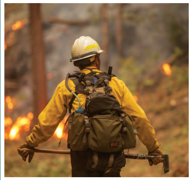
Happy Dog fire, Oregon, 2017.

D espite the enormous benefits that healthy forests provide, federal efforts to enhance their health and resilience are being impeded by antiquated approaches to funding the accelerating costs of fighting wildfires. Addressing the massive restoration backlog starts with fixing the broken federal fire budgeting process.