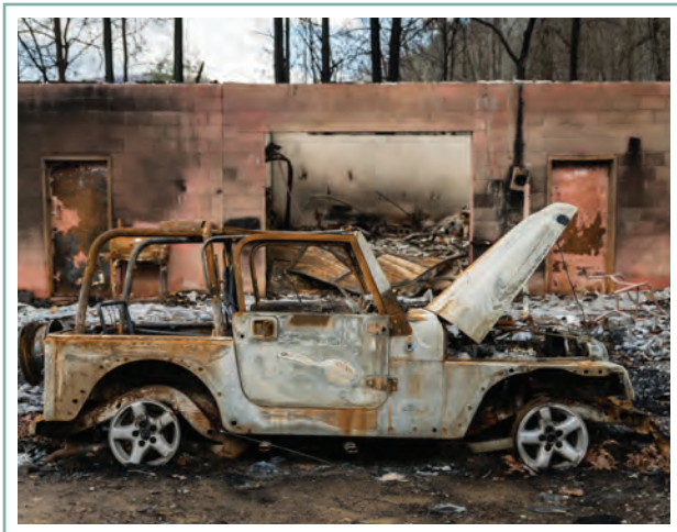
Fire damage, Gatlinburg, Tennessee, 2016.

E xtrême fires are not restricted to the arid West: the Southeast is also experiencing an increasing number of large and intense blazes. Many southeastern forests, especially softwood pines, are fire-adapted and depend on relatively frequent, low intensity burns for their maintenance.